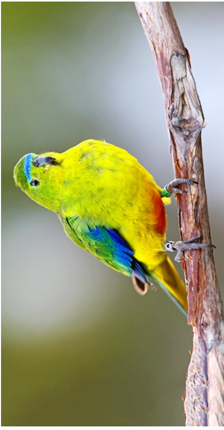
Orange Bellied Parrot