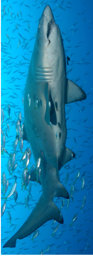
Grey Nurse Shark