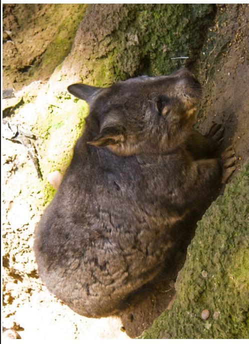
Northern Hairy Nosed Wombat