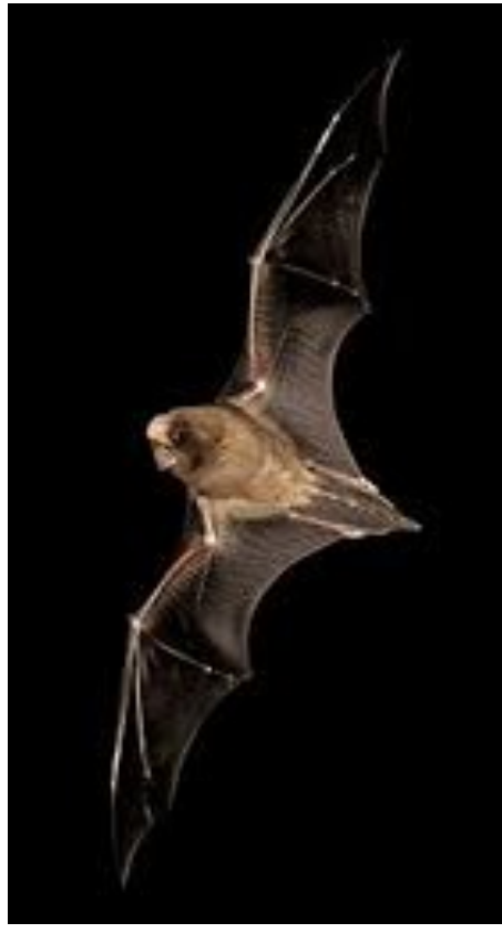
Southern Bent Wing Bat