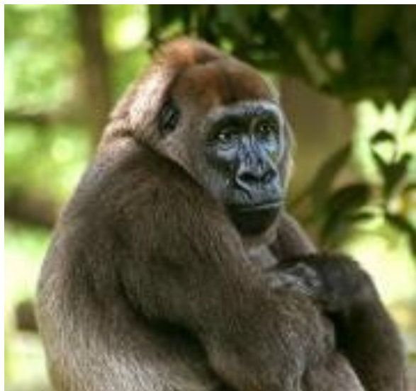
Cross River Gorilla