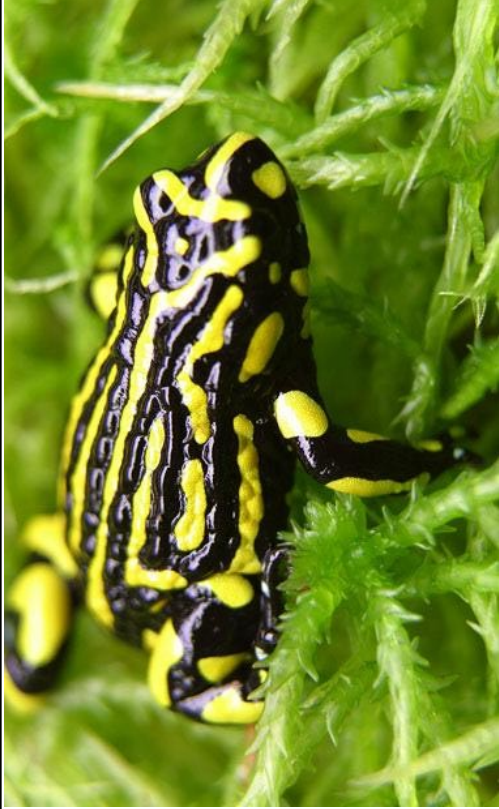
Southern Corroboree Frog