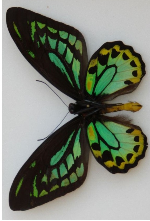
Richmond Birdwing Butterfly