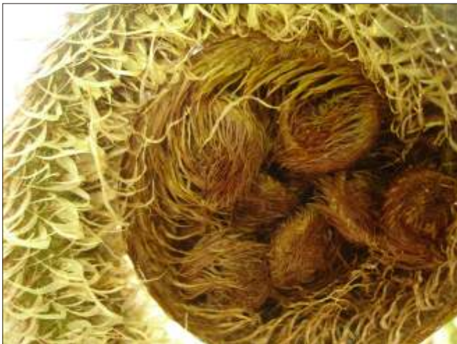
Close-up of an unfurled frond of the Soft Tree Fern Dicksonia antarctica .

Grade: Moderate to hard with two steep sections.