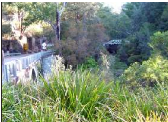
The historic Tunks Creek Bridge in Galston Gorge.