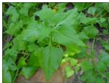
Above: Warrigal Spinach Tetragonia tetragonioides . Cooked leaves are edible.