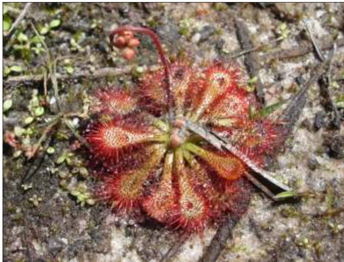
Sundew Drosera Spatulata