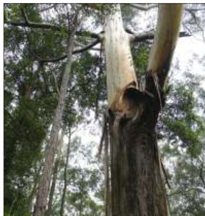
Blackbutt Eucalyptus pilularis