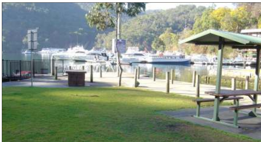
Picturesque Berowra Waters.

Grade: Moderate, with three steep sections.