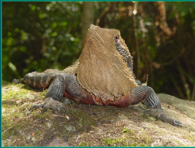
Eastern Water Dragons are a common site around this area