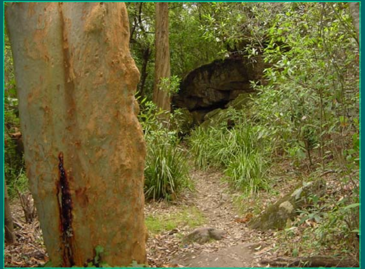
Diverse vegetation and creek life along Terry's Creek walk